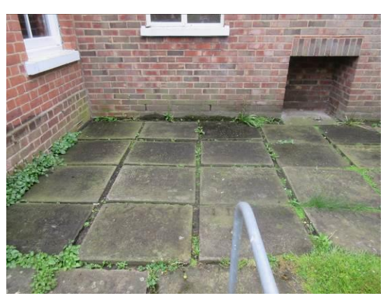
Statement of Significance

A meeting house of the 1830s, designed by the significant local architect Samuel Daukes, with additions of 1879 by J. P. Moore. The meeting house is set back from the street behind a contemporary gatehouse, and between the two buildings is a small burial ground. The site lies close to the commercial and historic core of the city, and is of high evidential, historical, aesthetic and communal value.